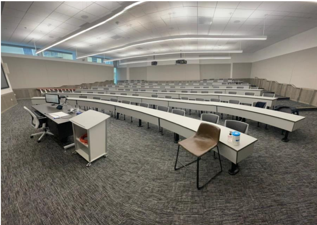
Extra Large Lecture Room