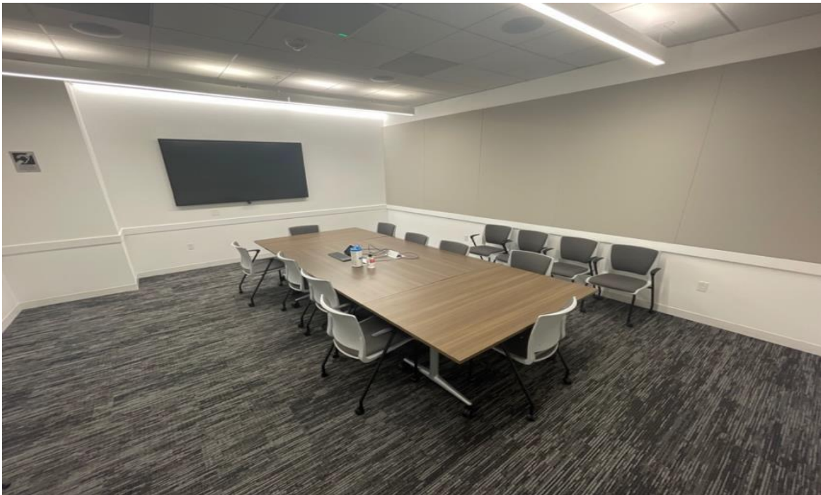
Large Meeting Room