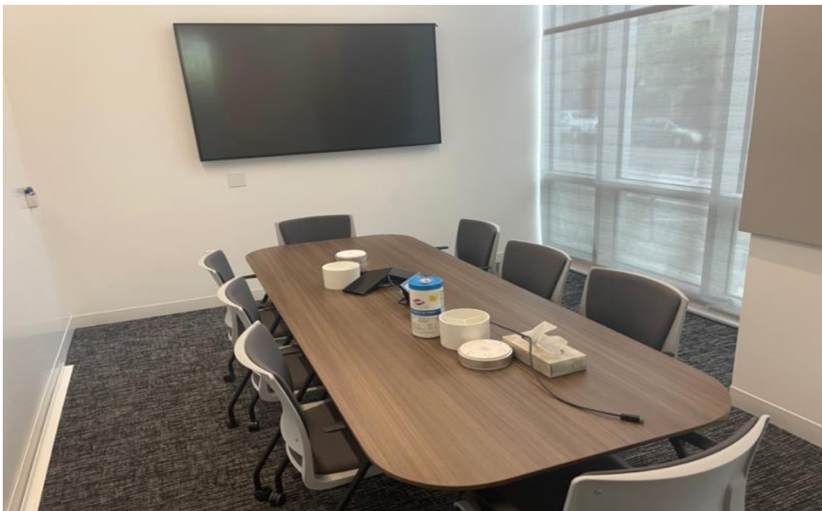
Extra Small Breakout Room