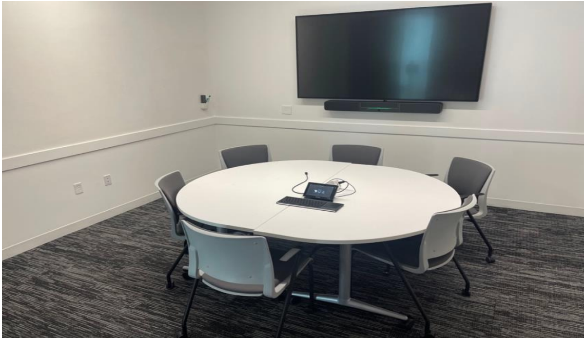
Small Meeting Room